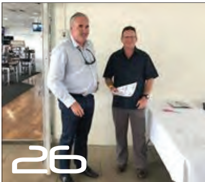
Newcastle Game Fishing Club