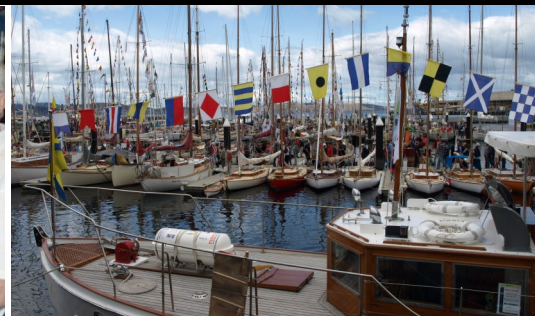
Boats entered in the Festival. Image by Tori Carr.