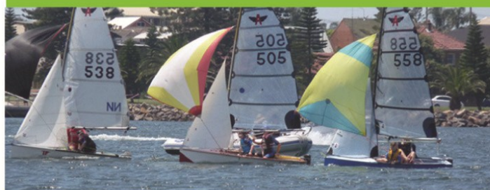
taken from NCYC's Committee Vessel, George Keegan. Boat and crew supported PHSSC for the weekend Championship.