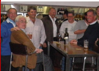
Some Friday night regulars

Raffles in support of Westpac Rescue Helicopter Appeal and Port Hunter Sailing Skiff Juniors (The Flying Ants Division).