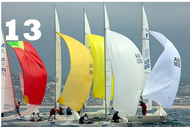
Cover image by Kylie Wilson