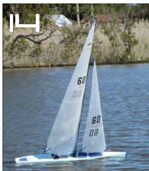
RC Yachts