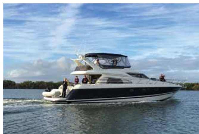
End of a great day.