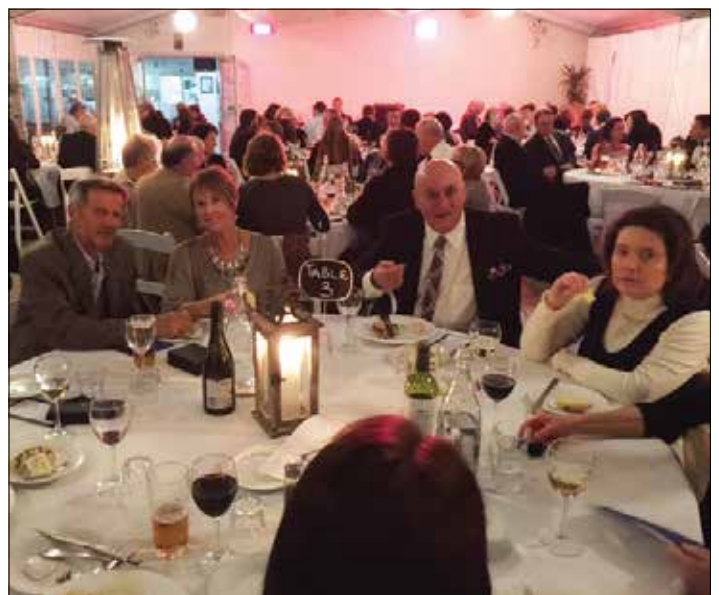
The function in full swing