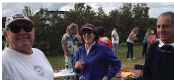
Watching coin throw & quoits.