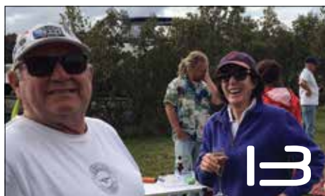
Up The Creek BBQ