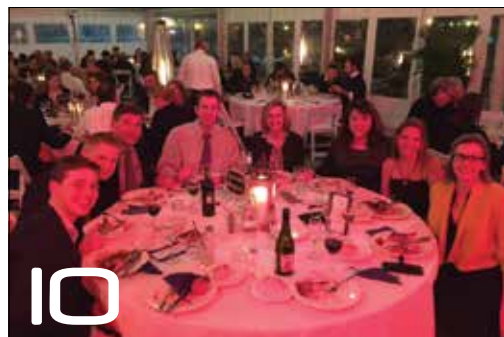
Presentation Night Image by Jane Hunt