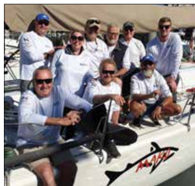
MAKO Crew - Sydney to Gold Coast July 2019

It was a tricky delivery "inside" from Southport to Brisbane ducking power cables and sneaking over