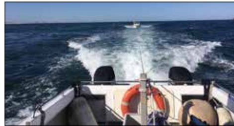
N30 assisting a 5m runabout some 500m off Strzelecki Beach

Every year there is a 'Blessing of the Fleet' in Newcastle. A number of local vessels take advantage of this event.