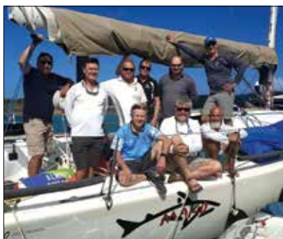
Brisbane to Southport Crew

The final leg saw the She Sails crew compete at the GALS regatta in Townsville.