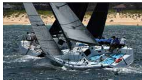
Team Good Form 'on fire' off Manly Beach