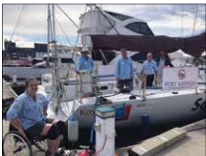
Sailors with DisAbilities

Again, the team from "Sailors with disabilities" have had a short stay with NCYC. These kind soles take people with disabilities on the specifically designed vessel to share passions of on-water and sailing experiences. The weather wasn't always favourable during the stay (sometimes gale force forecast), which kept them at the dock but entertained with knot tying, navigation, sailing terms and shoreside entertainment.