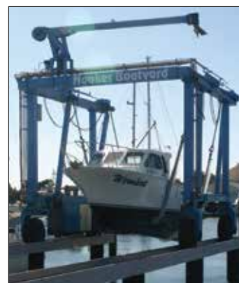
Lift-out