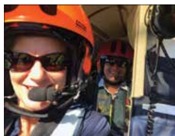
Helicopter Ride to Coal Ship

As I write this article, we are shaping up for the annual peak visitation for the Coates Hires V8 Supercars in late November. Visitation for this event is down on previous years, but should see the Marina to capacity over the weekend 22-25 November 2019.