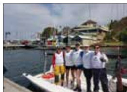
Ladies of the Sea Crew