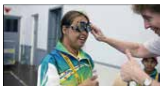
: A 2014 competitor from Myanmar (Burma) has their eyes examined at the Special Olympics.