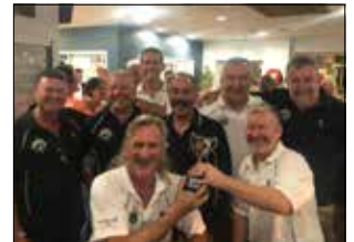
NCYC Cruising Fleet