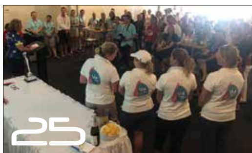
TYC Gals Regatta