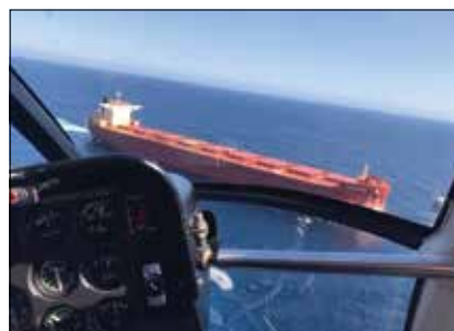
Helicopter Ride approaching the Coal Ship

I was fortunate enough to be a guest of a Harbour Pilot to bring a coal ship into the Port of Newcastle. We took a short helicopter flight on a picture perfect day out to sea, boarding a 360m vessel underway into Newcastle. 360m is one of the largest length ships that frequent Newcastle. The experience was fabulous, to say the least! It is unfathomable to understand how much visibility is lost from the