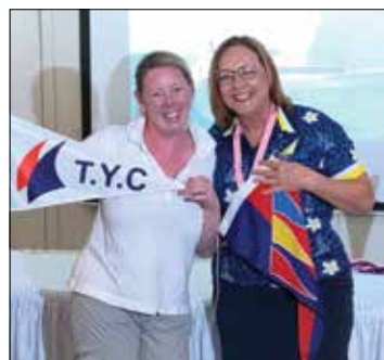
Presenting TYC & NCYC Burgees

consisted of six windward leewards and a passage race in the Townsville Basin. We had great sailing conditions with winds around 10 to 17 knots, with occasional gusts to 20, however the prevailing conditions were hot, sunny and humid!