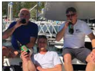
Breakfast of Champions

The first leg was the Sydney – Gold Coast race and first major offshore race for the boat. It proved one of the most pleasant offshore races you could do with cracked sheets flat seas and mild weather. The boat performed well and beat plenty of bigger boats home. The crew celebrate