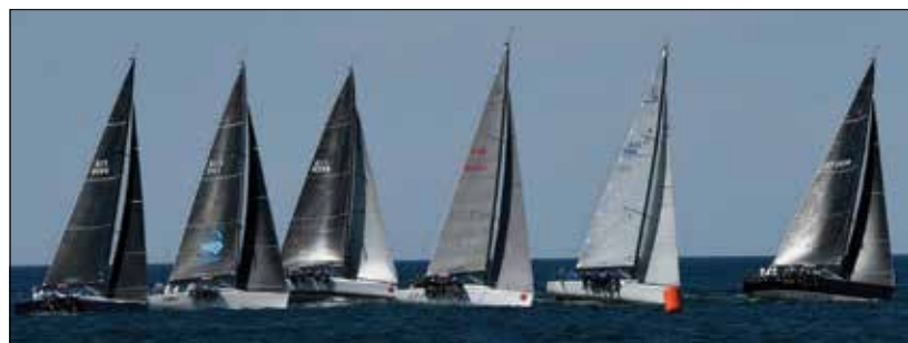
The tight Farr 40 fleet

headquarters in Manly for various forms of debrief and preparation for the following days racing.