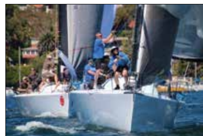
Team Good Form 'on fire' off Manly Beach