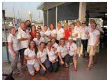
TYC GaLS group shot