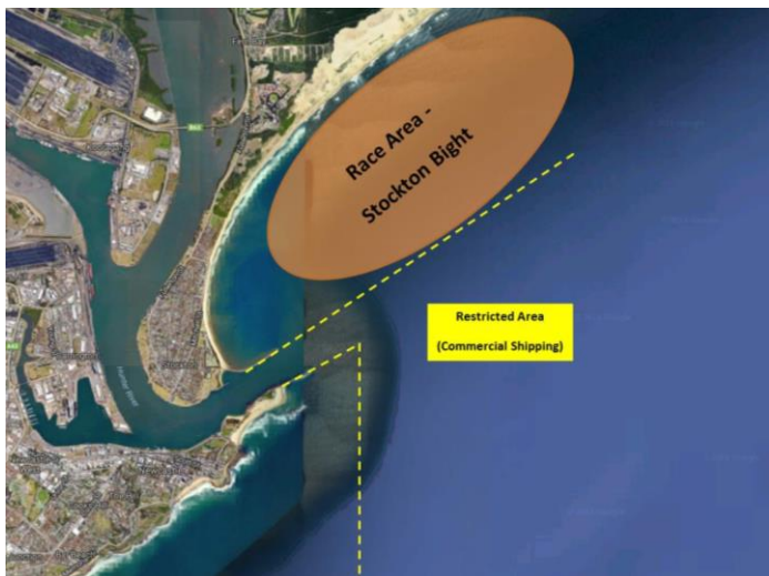
STOCKTON BIGHT RACE AREA