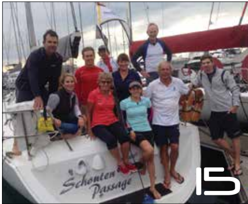
Sail Port Stephens 2016 IRC Winners