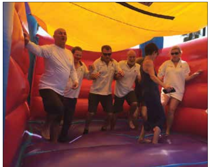
Above: Summer Salt Crew Enjoying the Xmas Jumping Castle