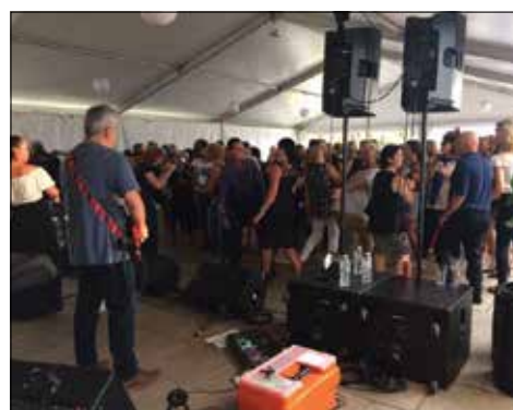
Left: The Years Entertaining NCYC Guests on Australia Day