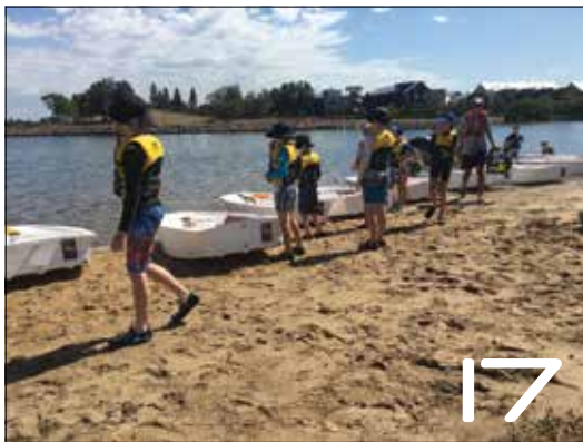
Sailing Academy Tackers

In this issue Autumn 2017 journal A quarterly publication