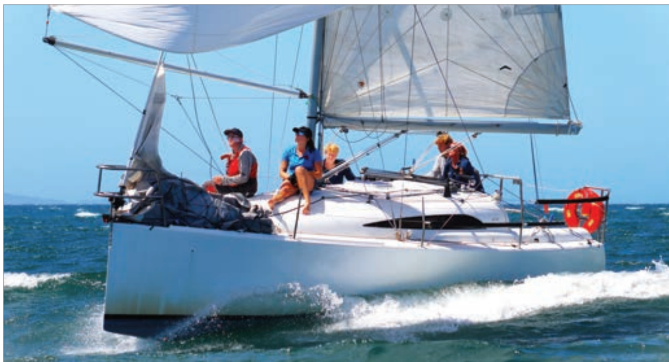
ABOVE: Neverland cracks a wave off Newcastle.